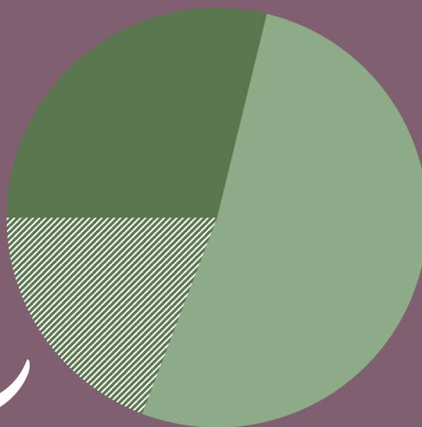
2021 DIRECT SERVICE CLIENTS

AND 40% OF LATINX CLIENTS ARE MONOLINGUAL SPANISH SPEAKERS